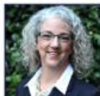
DEL CHERYL TURPIN 85th District House of Delegates