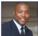
AARON ROUSE VB City Council Former NFL Star